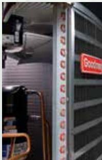
Goodman's SMARTCOIL™ 5mm tube condensing coil design optimizes the heat transfer ability of R-410A refrigerant compared to standard 3/8" copper tubing.

We know that the last thing you want to hear at night is a noisy air conditioner starting up. So, we build our Goodman brand GSX16 Air Conditioners with sound-dampening features that help ensure that your cooling system doesn't interfere with a good night's sleep. We rely on a quiet condenser fan system and a unique louvered sound-control top – to reduce fan-related noise. Your Goodman brand GSX16 Air Conditioner will keep your home cool and comfortable, year after year.